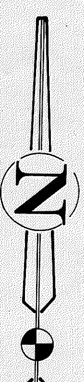
LOCATION MAP SCALE: 1" = 2 MI. 1/4-1/4 SECTION LINE